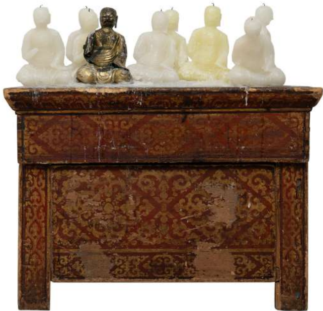
THE GAP , 2023 Installation, paraffin wax