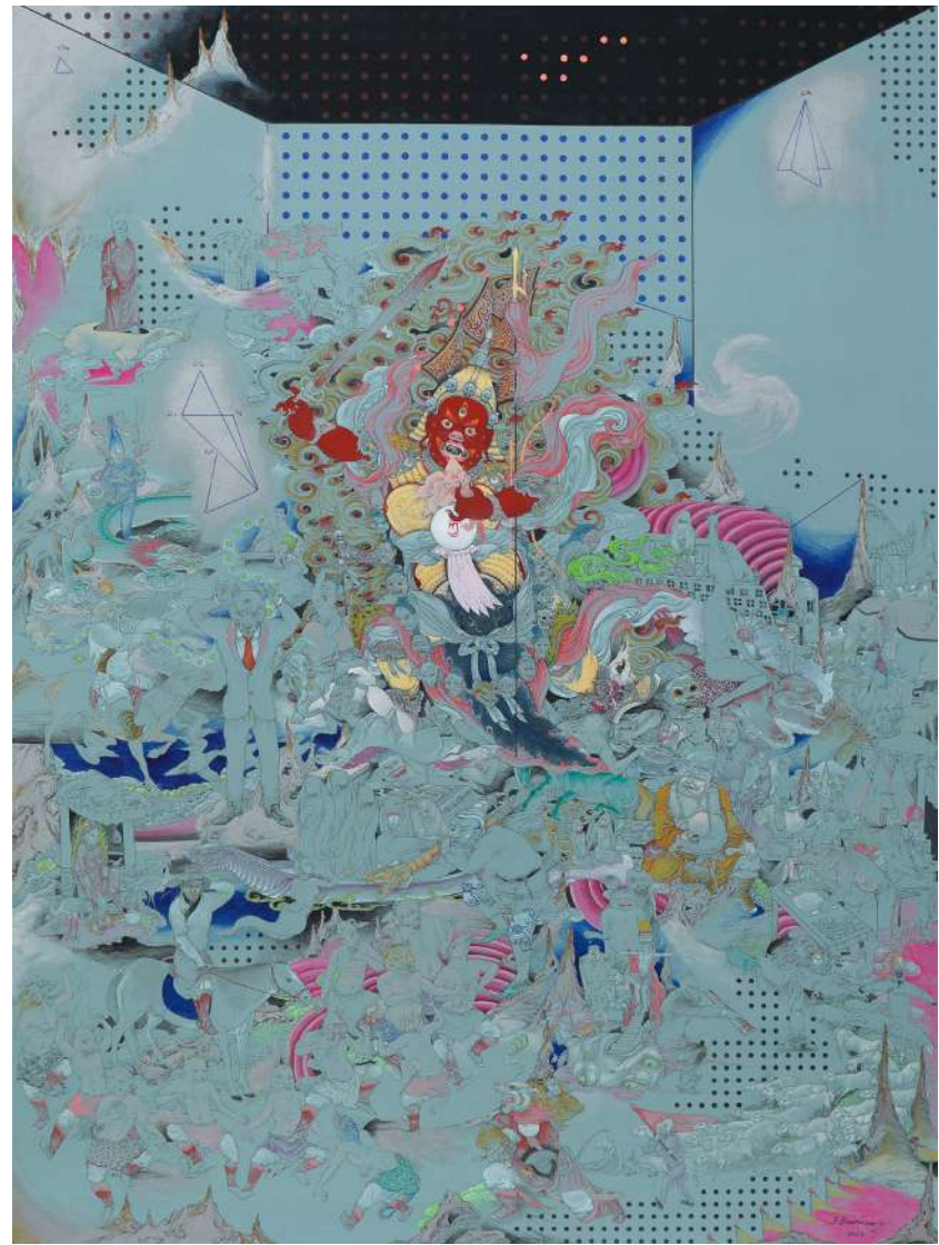
THE LAND OF JAMBU TREES, 2023 Acrylic on canvas, 200x150cm